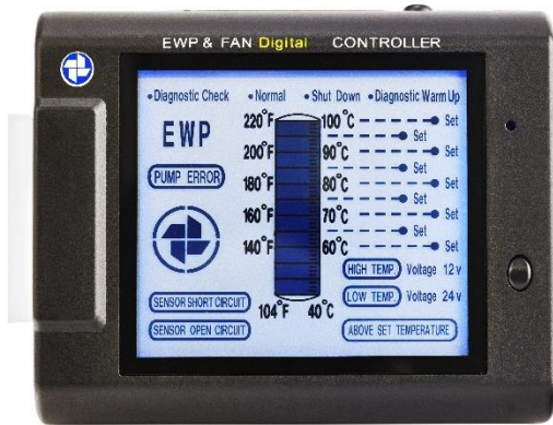
LCD EWP & FAN DIGITAL CONTROLLER

VISIT WWW.DAVIESCRAIG.COM.AU TO VIEW OUR FULL PRODUCT RANGE, INCLUDING PRODUCTS SUCH AS: